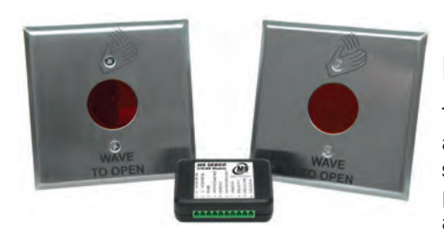
216-RK Retrofit Kit

The 216TX features all the benefits associated with MS Sedco's ClearPath™ line of wireless products: field-selectable frequencies, a minimum of 1-second transmission time, and a two-piece surface box which allows for easy access to the battery. Like the standard 216, the maximum range for hands free detection of the 216TX is adjustable.